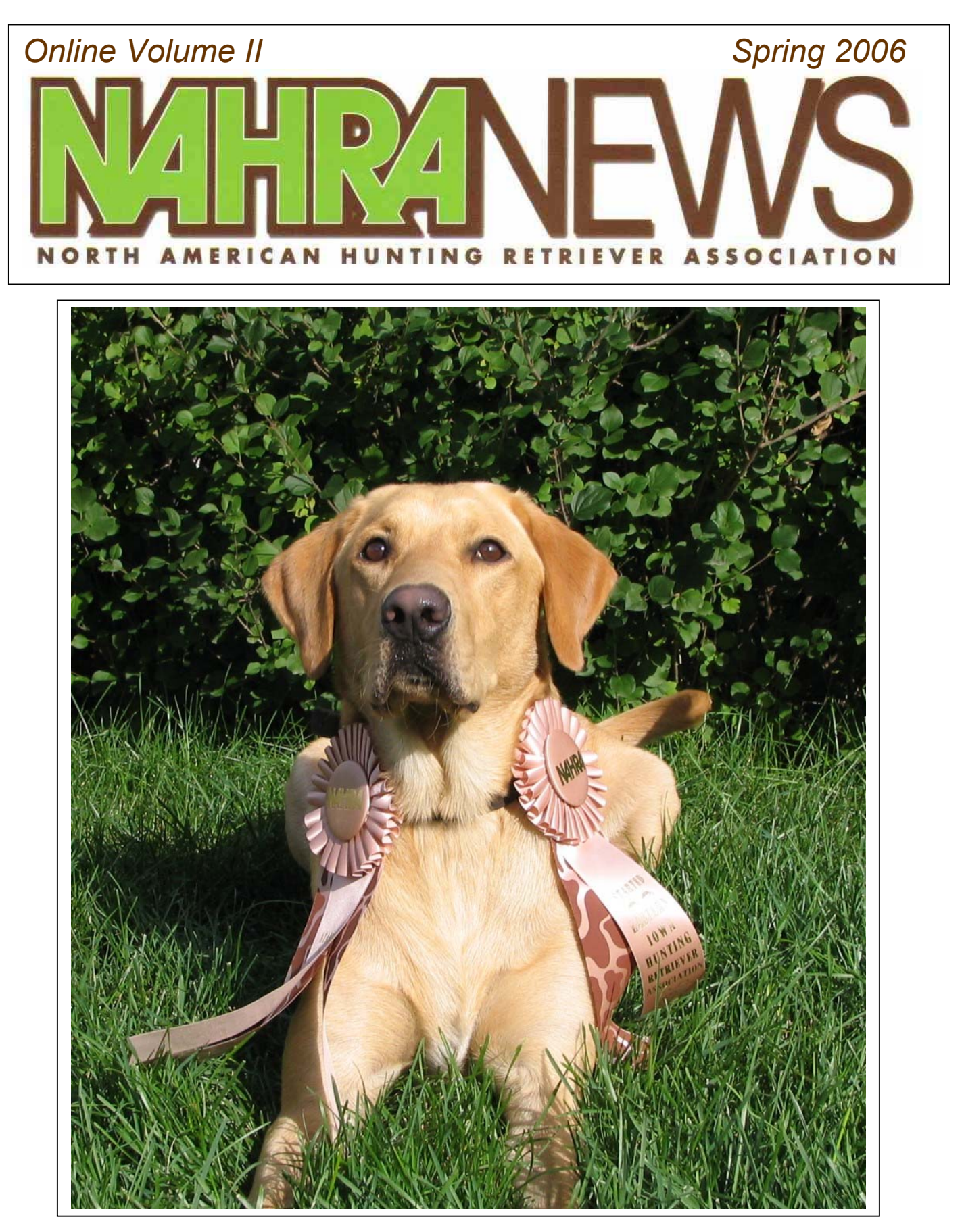
Conservation through the development of trained retrievers