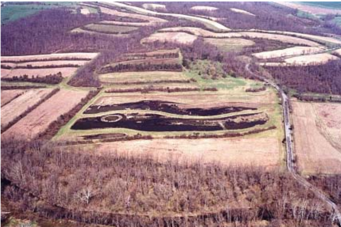
State Game Lands 169 is 2500 acres of waterfowl, upland bird and forested habitats. The Conodoguinet Creek bisects the area. The third picture shows pond complex 9.