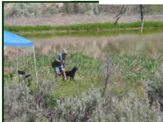
Fred Lysinger on the water series