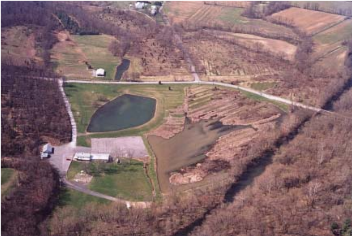
The second picture is also the BSF&G showing the whole complex. The pavilion in the middle left will house the ribbon ceremony and possible other activities. The clubhouse is located in the foreground.