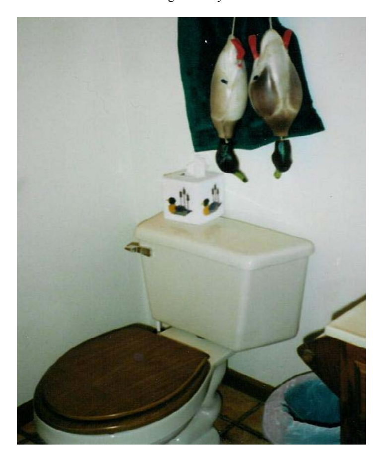
figure 1: The ideal "Sit-to-flush" test

range and the dog must check in on the handler so that he maintains that bond that makes them a team, not two separate entities charging down through a field for the "sit-to-flush." A charge to the flush with no hunt is a failure whether or not the dog is steady.